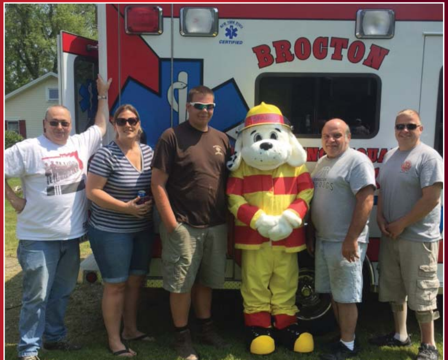
Brocton Fire Department attending 4th of July parade Van Buren Point